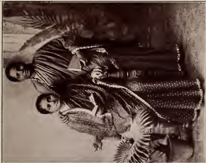
Graduates of the Shâradâ Sadan.